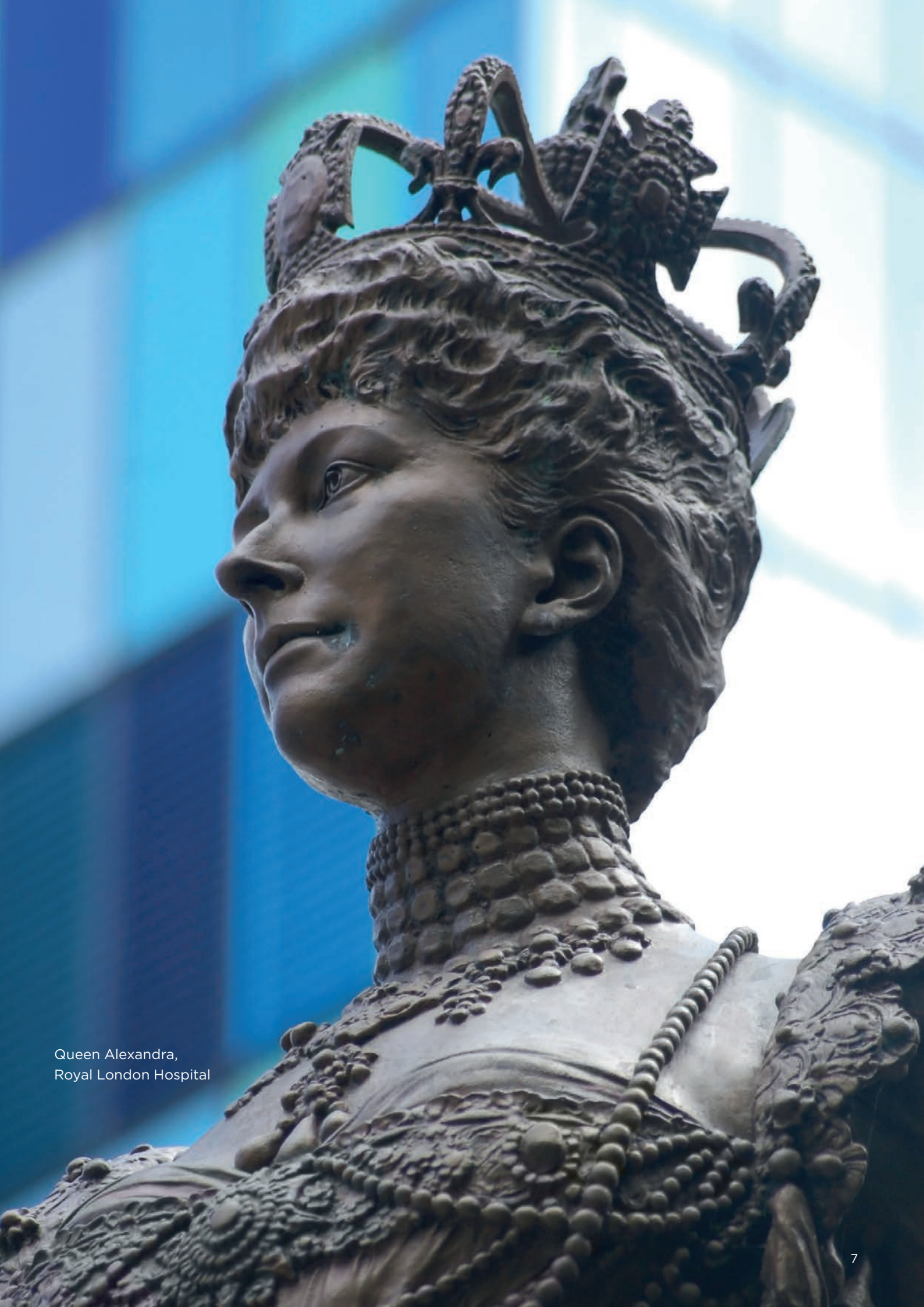
Queen Alexandra, Royal London Hospital